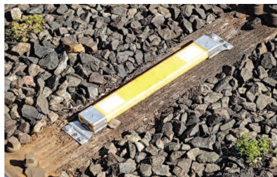
Tracklink III® Beacon

Provides platform specific data by way of the train mounted Tracklink III® Reader and the track mounted Tracklink III® Beacons. The Tracklink III® system complies with RIS-2795-RST.