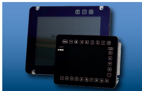
ASDO Drivers Display

12.1" or 6.5" Display with function keys. Provides information to the driver of the train configuration and what doors are selected.