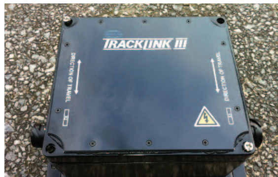
Tracklink III® Reader