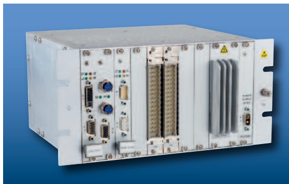
Typical ASDO Controller

Other modules are available and any combination of cards can be implemented.